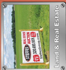
Land & Real Estate